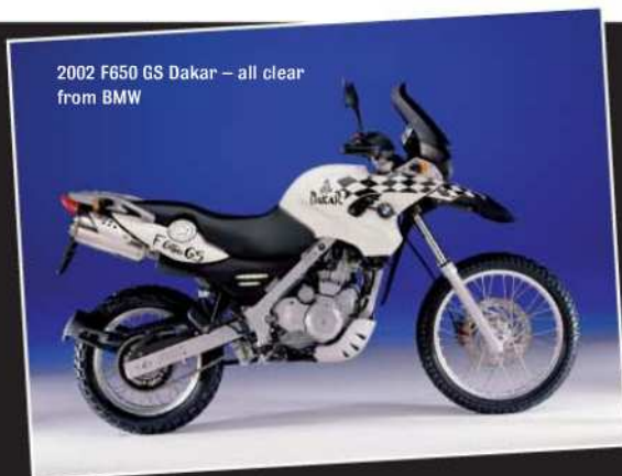
2002 F650 GS Dakar – all clear from BMW